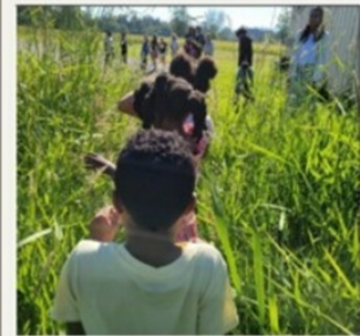
NATURE WALKS & PLANTING