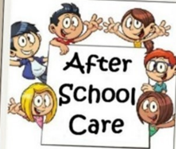
Available for Additional Cost