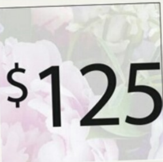
PRICE PER WEEK