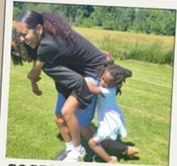
SOCIAL EMOTIONAL LEARNING